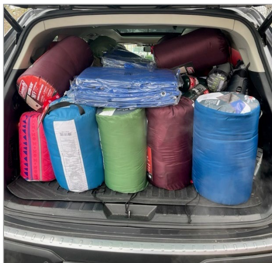
A volunteer fills her vehicle with survival gear for distribution at The Father's Heart emergency warming site

In January 2024, Clackamas County mobilized severe weather resources in response to the winter storm that impacted the entire community for several days with sleet, snow, freezing rains, high winds, and low overnight temperatures. Members across the Housing Services Team participated in County-wide coordination calls prior to, during, and after the weather event. Outreach during this time shifted to providing survival gear and immediate connection to warming shelter options. Outreach staff assisted in transporting vulnerable individuals to safe sheltering options. Housing Services staff volunteered at emergency warming shelter locations across Clackamas County and assisted in keeping individuals safe and providing goods, information, and resources. Vital supplies included sleeping bags, gloves, hand warmers, and warm clothing.