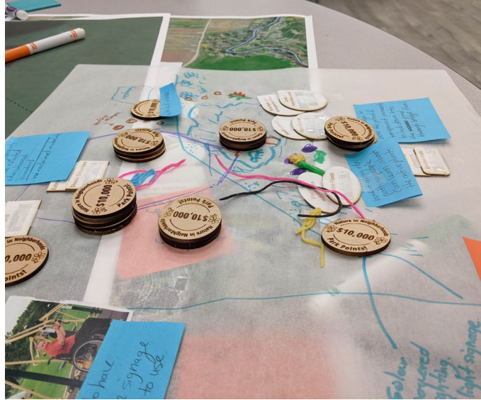
Figure 4: Community design workshop, summer 2023.