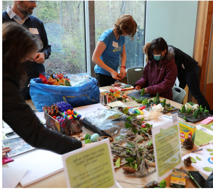
Figure 3: Idea collection event, spring 2023.

To verify eligibility, the Committee determined to use participants' self-attested age and zip code to determine eligibility for both idea collection and the community votes. In addition, contact information would be requested for submitted ideas to enable continued project collaboration.