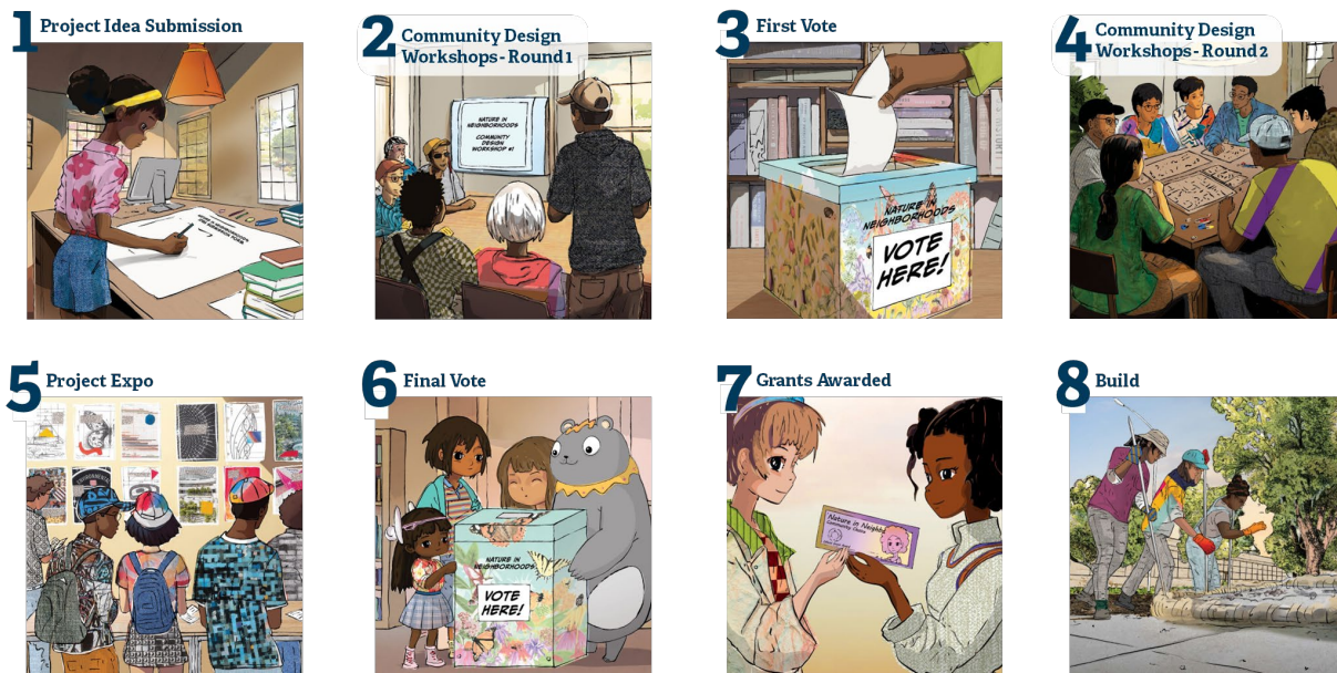
Figure 2: The participatory process of the community choice grants.

The participatory model presented in this guidebook was based on participatory budgeting principles and developed in collaboration by the Program Design and Review Committee and Metro staff to interpret the purpose, principles, and criteria of the 2019 parks and nature bond through the values of community engagement and community ownership, racial equity, and transparency. These goals guide a framework that adheres to legal and fiscal constraints, represents project development best practices, and respects the staff capacity and autonomy of local jurisdictions within the Metro region.