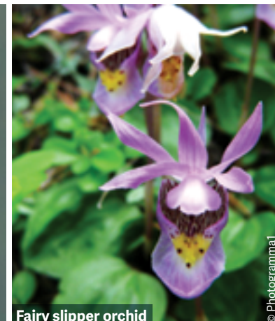
Fairy slipper orchid