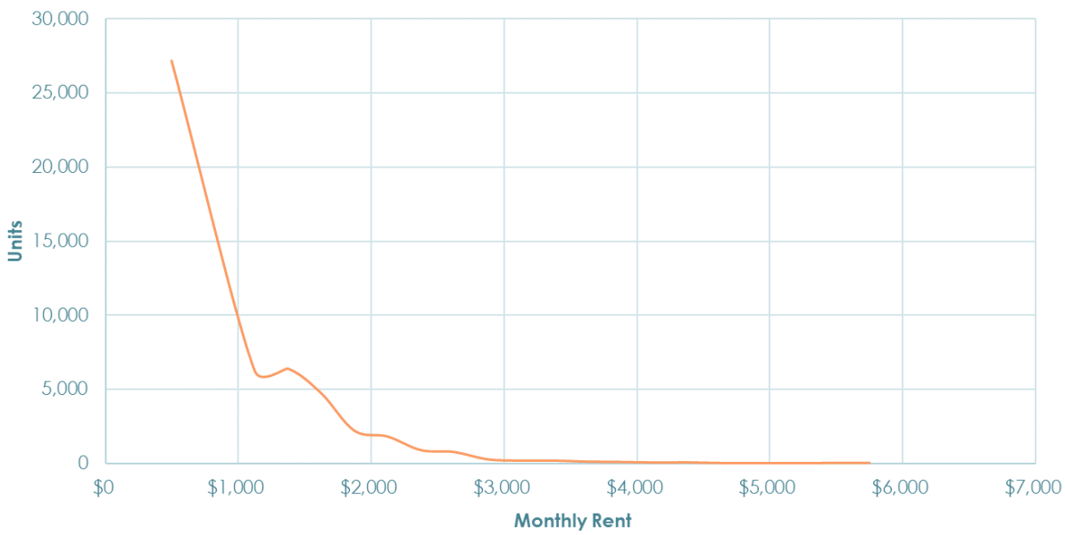
Figure 16: Assumes households spend a percentage of their income on housing based on current trends

The chart above shows the forecast of renters by life cycle and expected rent levels, if households spend a percentage of their income on housing based on current trends. This means that households, particularly lower-income households, will likely spend over the 30% threshold of household income that is commonly used as a metric of affordability. Assuming that this is the case in the future, young householders, single adults and older residents are more likely to be renters and have lower household earning potential and therefore fall into the lower rent need spectrum in which many will need some form of government assisted housing (i.e., rent subsidy). Of renters, the forecast under these assumed conditions is quite stark, projecting fewer than 10% of renters in future years (2024-44) will have the financial ability to afford market-rate rents given their household income. (Note: this analysis may somewhat overstate willingness to pay due to limitations on not being able to account for the accumulation of wealth, particularly retirees who may be on fixed incomes but have amassed a lifetime of savings for their retirement. Affordability in these cases based on annual earnings and income may be supplemented by other assets to pay for monthly shelter expenditures.)