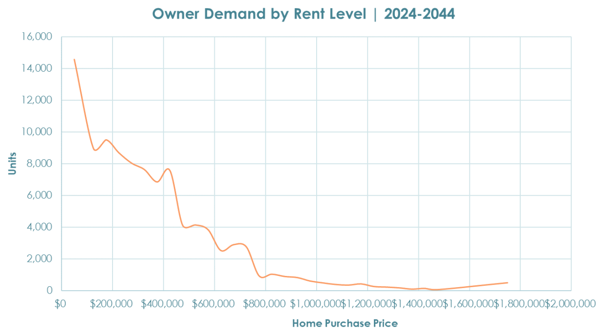
Figure 17: Assumes households spend a percentage of their income on housing based on current trends

household life cycle cohorts suggest very few will be in the home buying market. There are several reasons for this: 1) younger households generally earn less; 2) are unable to qualify for mortgages; 3) don't have enough saved up for a down payment; 4) and the demographics in the future lean toward proportionally fewer younger households in the region as there will be fewer due to declining birth rates and thus lower household formation rates.