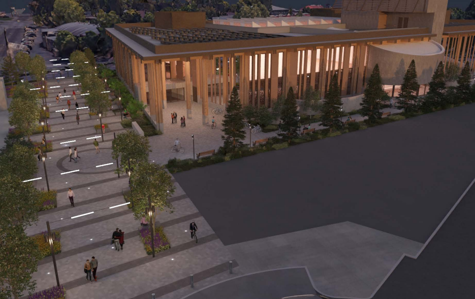
Urban Transformation: Gresham Civic Hub $389,000 Tri-Met