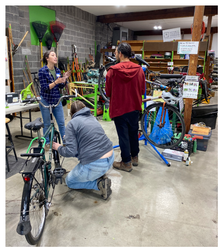
Bicycle repair workshop at Green Lents

communities of color, immigrants and low-income families. Tool libraries help communities reduce waste and save money by offering a wide variety of tools for home and garden projects that can be borrowed at no cost to members.