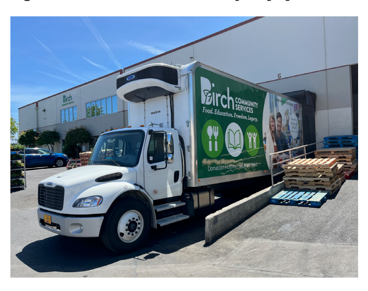
Birch Community Services' new refrigerated truck

In 2024, Birch Community Services completed two grant projects that significantly increased the organization's capacity to rescue and redistribute food. Metro grant funds were used to purchase a new refrigerated truck and a 10-door freezer to safely transport and store donated items. Together, these projects increased the organization's annual food rescue capacity by more