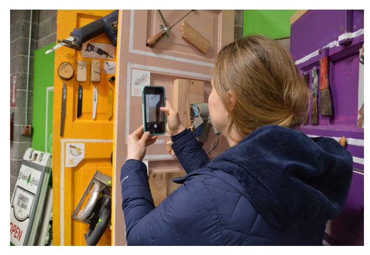
Scanning a QR code for tool instructions at Green Lents

Green Lents used an Investment and Innovation grant to expand access to the community tool library by removing barriers for residents that speak a language other than English at home. Staff developed educational and outreach materials using videos, illustration, and infographics to convey information without relying as much on written text. New signage and instructional displays in the tool library make it easy for anyone to find the right tools and learn how to use them safely.