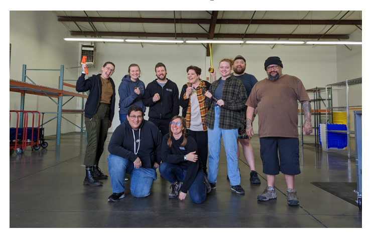
Community Warehouse team celebrating the new Gresham warehouse

Community Warehouse provides donated furniture and household items to neighbors seeking the comfort and dignity of a furnished home while overcoming adversity. With support from an Investment and Innovation grant, the organization expanded into Gresham with a new donation center in April 2023. This is the organization's third location and brings important services to an underserved part of the region. The project was a collaboration with ReClaim It!, providing a space for other reuse organizations to co-locate and share resources for reuse and repair.